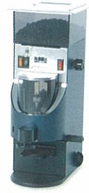
MS 85 Automatic